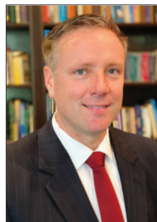
Christopher Phillip Kimball